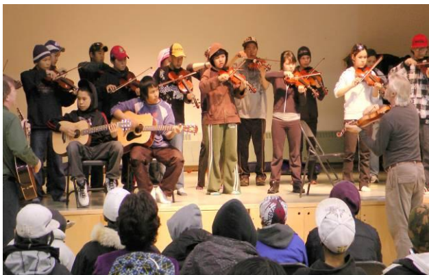
22 children and 15 adults participated in the spring workshop which culminated in a well-attended community performance.