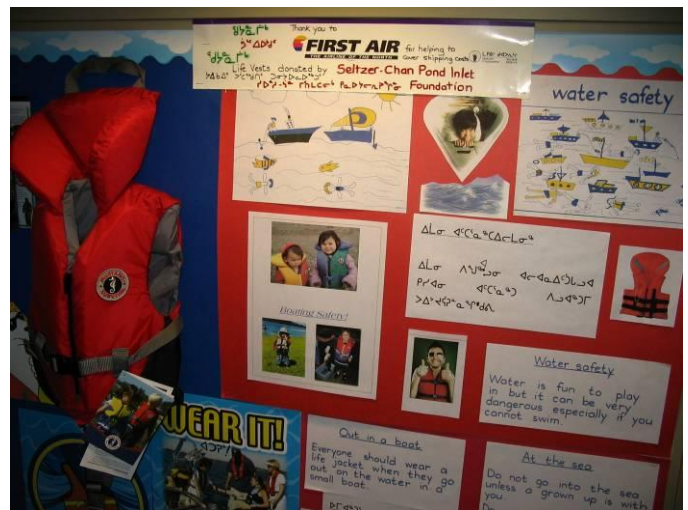
The Boating Safety display in the Nattinnak Centre lobby.

August was Boat Safety Month in Pond Inlet. Colouring and activity books and 38 life-saving vests and suits were provided by the foundation. First Air donated part of the shipping costs.