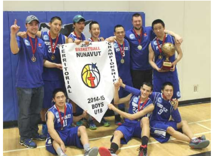
The Boys Basketball Team with their gold medals, trophy and banner.

We won! The foundation helped the Pond Inlet Boys Basketball Team travel to Iqaluit for the Territorial Championship Tournament this spring. The Pond Inlet team came in first of the nine participating teams. This was a special victory because some of the boys will graduate this year so won't be able to play in this tournament again.